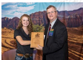
3rd Place – University of Wyoming