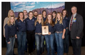
1st Place – University of Nevada- Reno

This contest provides a way for prospective students to research the Range Programs of the active colleges and universities around the country. It provides information on the participating schools' annual activities and events available to everyone. Student chapters build a display based on the theme of the Current Year's Annual meeting which is judged on appearance, ability to follow theme, and professionalism of students.