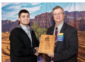
2nd Place – Southern Utah University